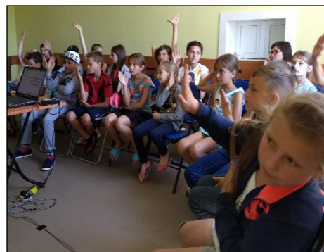
Children at the day camp.

CHILDREN AND YOUTH PROGRAMS. The same programs that were started last year were continued this year. They have been very successful as more than 100 children and young people were involved in these programs. The community center was full of life seven days per week with various activities. The clubs include: The English Club, The Reading Club, The Guitar Club, The Math and Science Club, The Adolescents Club, The Youth Club, The Volunteering Club, and The Culinary Club.