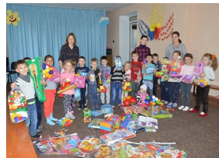
Educational materials and toys for the kindergarten.

KINDERGARTEN DONATION. This past year we donated funds for the purchase of educational materials for about 80 children at the daycare/ kindergarten. The teachers, parents and children were very thankful for this donation as it really helps the educational process.