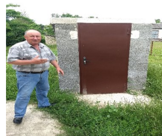
School principal in front of the new cellar.

SCHOOL ASSISTANCE. WHI provided funds to the school in Cobani to build an underground cellar where they could store their canned foods, fruits and vegetables for the winter. This will allow the school to purchase fruits and vegetables in the fall after the harvest before prices go up throughout the year. By building the cellar, the school has been saving about 30% on their purchase of fruits and vegetables.