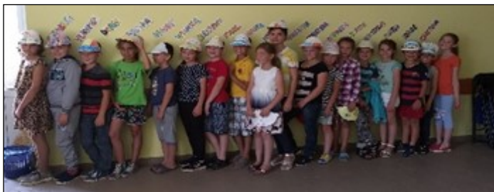
Children at the day camp.